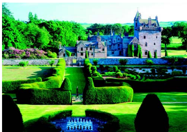
The venue for the SOL2010 conference dinner, Guthrie Castle.

The programme includes sessions on: SOL Biodiversity & Evolution, Plant Growth & Development, Biotic Stress, Abiotic Stress, Informatics and Computational Biology, Tools & Emerging technologies, The SOL Genomes, Translational Genomics & Molecular Breeding, Metabolomics & Proteomics, as well as the usual parallel workshops. The venue has several meeting rooms available for small meetings (10–40 people) so if you have ideas for additional sessions or meetings for SOL2010 please get in touch with the organisers as soon as possible. A draft programme is on the conference website ( www.sol2010.org ), and full programme is coming soon. The link to the online registration site ( https://reg.istrations.com/delegate/events/DNDSOL2010 ) is also accessible from the SOL2010 site.